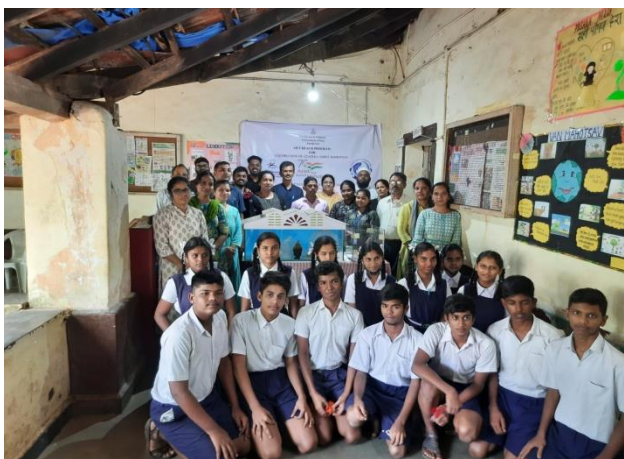
Date: 26/07/2022, Venue: Government High School, Bicholim