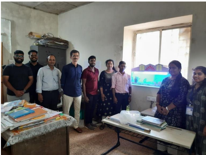
Date: 27/07/2022, Venue: Government High School, Ponda