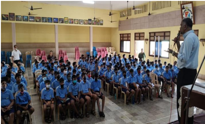
Date: 29/07/2022, Venue: Government High School, Vasco